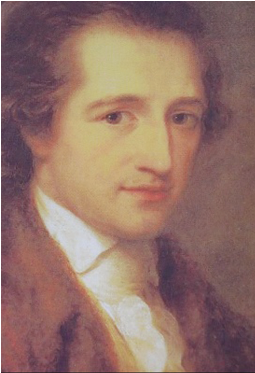
Johann Wolfgang Goethe (1749–1832), Goethe-Nationalmuseum Weimar

Like historical practices of letter-writing, contemporary digital social networks demonstrate how different forms of media serve as spaces of negotiation to define, shift, confirm or reject conceptions of the self and the other. Just as in digital social networks, spheres of intimacy in eighteenth-century letter-writing have blurred boundaries that are constantly redrawn. Then as now, the subject is constituted within these boundaries through a dialectic of revelation and concealment, of communicative accessibility and self-securing foreclosure. As much as epistolary correspondence contributed to the idea of the autonomous individual through