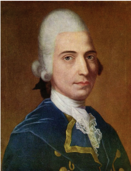
Gottfried August Bürger (1747–1794), Gleimhaus Halberstadt

In this regard, the ‘authenticity’ of the depiction is relative. Just as the identity of letter writers in Gleim’s correspondence was a collective creation, a number of subjects contributed to the visual representation of an individual in the Temple of Friendship. Likewise, this is reflected by the specific arrangement of the images. The walls of several rooms were completely covered, hanging in multiple rows, as the portraits took up more and more space in Gleim’s home. He began to arrange the portraits into groups so that the visual adjustment echoed the communicative relationship between the depicted friends. The spatial distribution