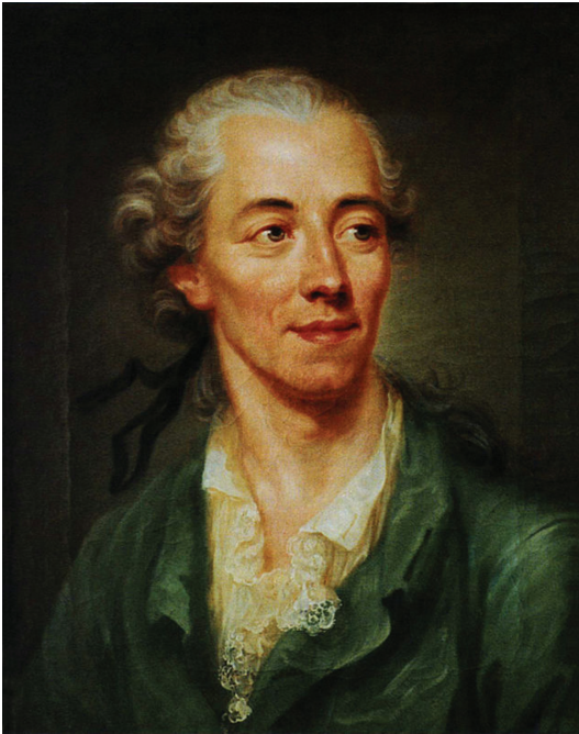
Johann Georg Jacobi (1740–1814), Gleimhaus Halberstadt

Sometimes we believe not to hear two hearts, burning for one another, but two cold-blooded persons that have shouted themselves hoarse, exhausted by frosty hyperbole and empty exclamations. [...] It might also occur to the reader that for almost two years two witty heads have written about nothing else than their heated love, about beautiful bosoms, maidens, cupids, admirable letters, songs and the like. 6 (Anon. 1769, 193f.)