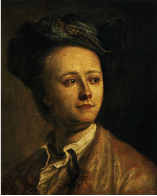
Karl Wilhelm Ramler (1725–1798), Gleimhaus Halberstadt

The image becomes an object of witty conversation with the absent addressee of the letter. Its presence confirms his affiliation to the circle of friends, just as the writing itself constitutes a social bond across physical distance. By referencing Pygmalion, Sulzer alludes to the unreal character of their conversation – ‘as if’ your painting was alive, ‘as if’ we were talking, ‘as if’ you were here – while Gleim ingeniously reproaches Ramler for his facial expression, pretending it was the actual person not a static image he is talking about.