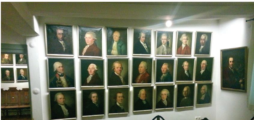
A wall of portraits in Gleim's Temple of Friendship

Ramler's enthusiastic reaction to Gleim's portrait and the account of him speaking and toasting the portrait, integrating it into the circle of guests as if the painting were the actual person, displays the significance of the visual image as an object of interaction. The epistolary correspondence is sublimated into the portrait (Stanitzek 2010, 246). Gleim even had a special seat constructed that was easily movable and contained an integrated writing board to be able to face the portrait of the addressee while writing a letter. As in the digital technologies of contemporary social media, the absent subject is evoked through an amalgam of scriptural and figurative representations, an elaborate apparatus to embody the absent. In this regard, the German literary critic Georg Stanitzek calls Gleim's Temple of Friendship a 'control room of sentimental telecommunication' 22 (Stanitzek 2010, 245).