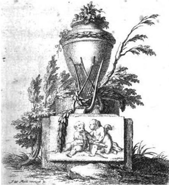
Letters by Mr Gleim and Mr Jacobi, frontispiece