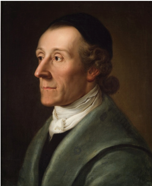
Johann Kaspar Lavater (1741–1801), Gleimhaus Halberstadt

5). As in digital social media, there are multiple dynamic spheres of communication, partially overlapping and consistently changing. Meanwhile, as in historical practices of epistolary correspondence, users of online social networks have only limited control over who is going to view their content. But in the same way as many of these platforms offer tools to define and restrict the possible audience, it was quite common during the eighteenth century to mention explicitly who was to be allowed to read a certain letter and even more frequently who was not. Resistance against a culture of the written word increasingly present in all areas of life was therefore as much of an issue as it is today. At the point where we suspect our most private and intimate thoughts are reaching an audience we never intended, complete withdrawal from written communication often seems to be the only alternative option. One of the most prominent examples of such a situation is provided in a letter from Johann Wolfgang Goethe to Johann Caspar Lavater. The latter was known for his very liberal interpretation of epistolary discretion and Goethe threatens to break off correspondence if his letters continue to make the rounds: