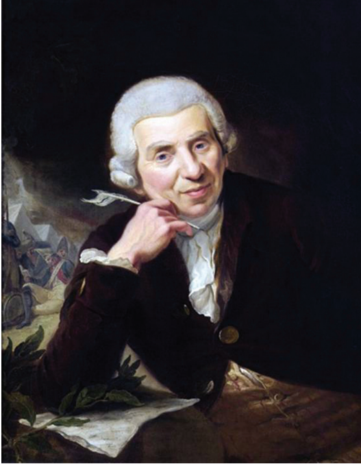
Johann Wilhelm Ludwig Gleim (1719–1803), Gleimhaus Halberstadt

Gleim stayed in Berlin for some time before moving to the provincial town of Halberstadt where he was appointed secretary of the cathedral chapter. Like many of his educated, middle-class, German contemporaries, he was forced to build a life away from the cultural and urban centres for financial reasons. Politically-fragmented Germany offered its intellectual elite diverse ways of securing a livelihood but these lucrative posts were scattered throughout the German states. Thus, the emerging culture of letter-writing originating in England and France fell on fertile ground in Germany, and was even more influential there than in other parts of Europe as it facilitated intellectual and artistic exchange across often considerable geographical distances.