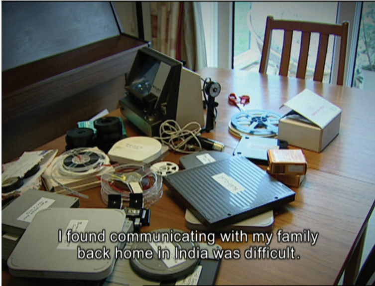
Figure 1: The filming equipment.