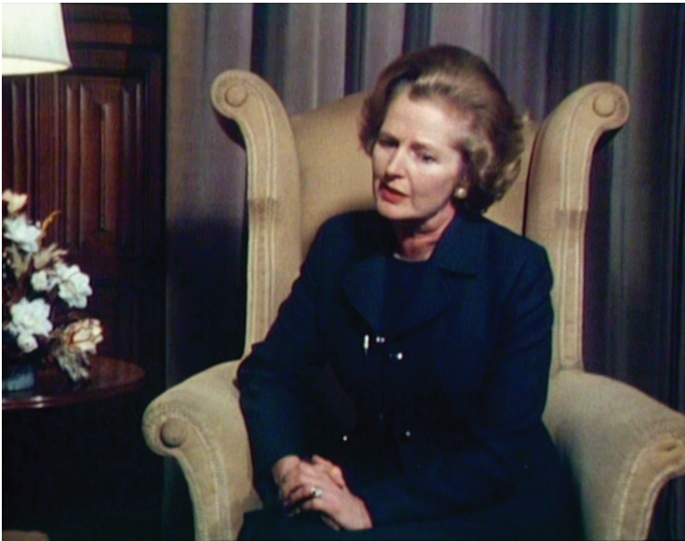
Figure 3: Margaret Thatcher.

Although British anti-immigrant attitudes are not presented as the decisive factor for his and his family's return to India, they are closely connected with the macro-narrative of return. Thatcher's historic statement