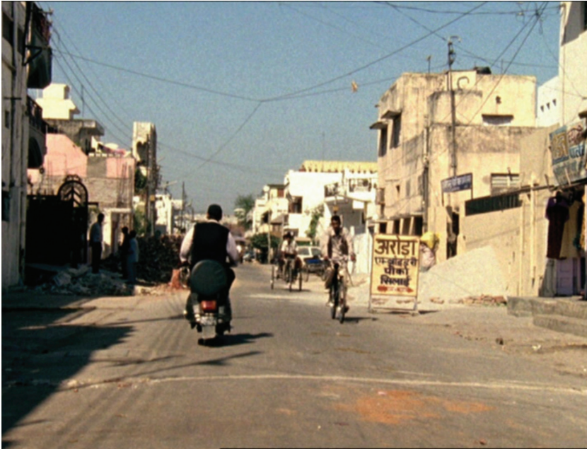
Figure 4: Street scene in contemporary India.

Beside the dramatic interplay between Yash's yearning and resistance, and the powerful pressure from his parents to return, the re-construction of the family's actual nine-month return deserves attention as a prime example of the interplay of perspectives, images and voices across time. The journey is located exactly in time, "5th February 1982," and starts with the well-known symbol of migration, the airplane, 6 then shows, in colour, relatively non-descript scenes of street life, school children, traffic (Fig. 4), the interior of a house. The whole section set in India lasts about 16 minutes (00:36:15–00:52:00), which is a substantial part of the 70-minute film. Because Yash did not film cine-letters any more after his return to Meerut, Sandhya had to have her family reconstruct that time in retrospective. She builds this part of the narrative from interviews with her mother, father and two sisters, interspersed with more footage