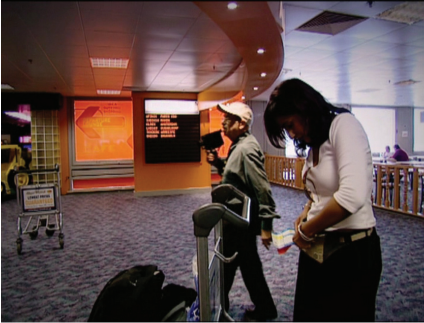
Figure 6: At the airport in the 2000s.