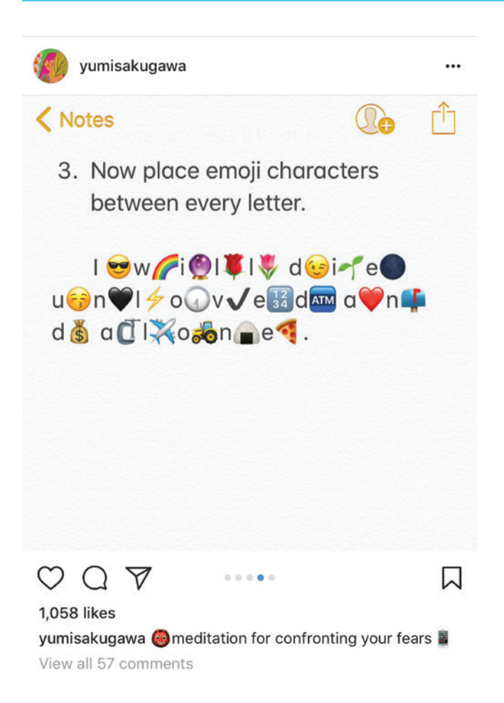
Figure 1. Artist Yumi Sakugawa uses Instagram to explore digital mindfulness techniques.