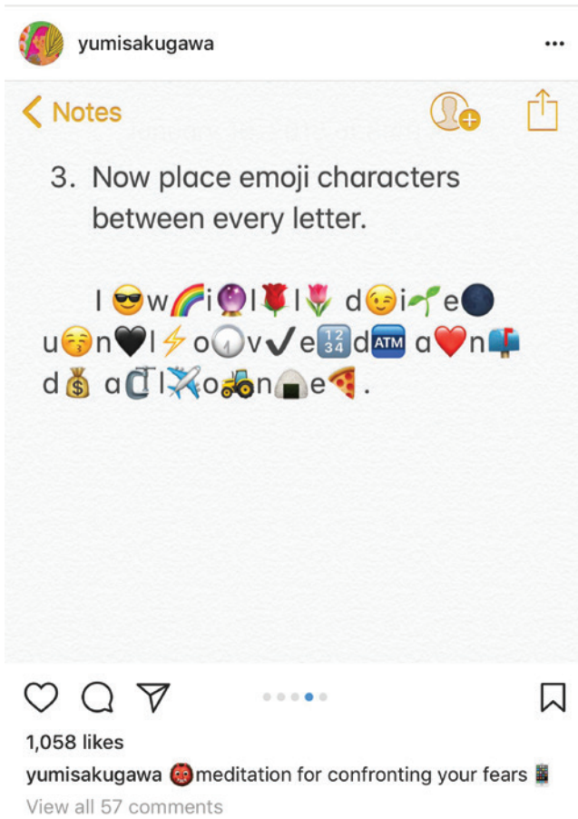
Figure 1. Artist Yumi Sakugawa uses Instagram to explore digital mindfulness techniques.