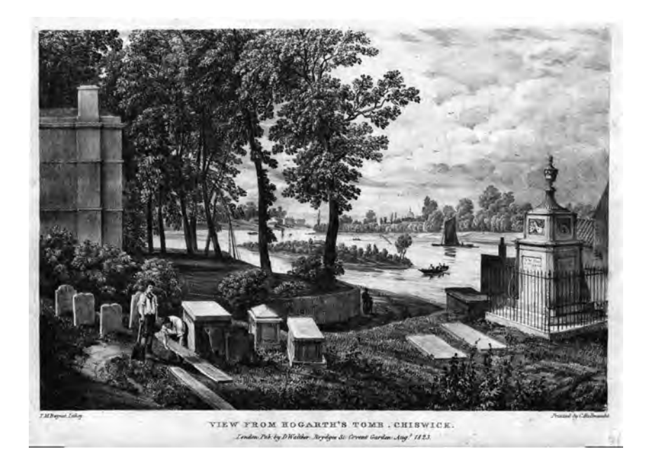
Fig. 12 T. M. Baynes, lithog., View from Hogarth's Tomb, Chiswick , 1823

including a View from Hogarth's Tomb, Chiswick (1823)—'a memento of a visit to the family monument'<sup>92</sup>—depicting a romantic scene set among leafy trees overlooking the River Thames, with a distant view of St. Paul's Cathedral on the horizon<sup>93</sup> (Fig. 12).