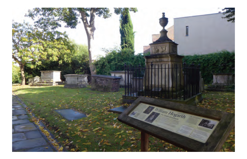
Fig. 14 William Hogarth's tomb with accompanying biographical information St Nicholas churchyard, Chiswick

Is it only coincidental, I wondered, that it is in Chiswick—where Hogarth's 'honour'd dust' still 'lies'—rather than in Leicester Square, that his life and his significance as a British artist and chronicler of his times are