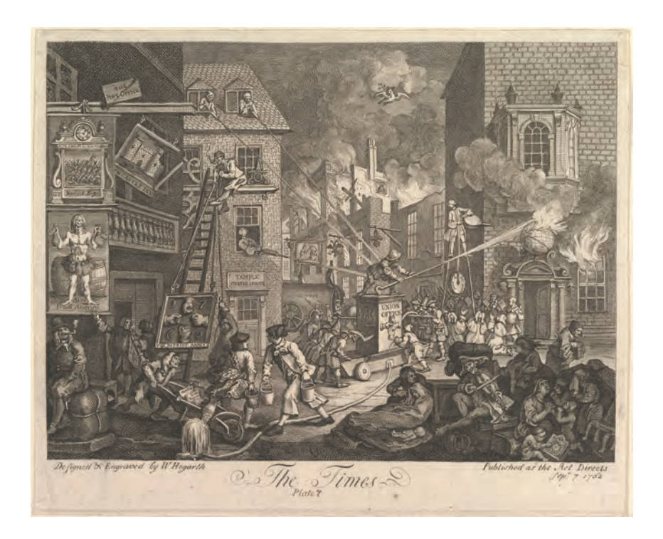
Fig. 4 William Hogarth, The Times Plate 1 , 1762

The print that Ireland identifies as being ignited by 'an inch of candle' is The Times (the title of which is legible, Fig. 3), which Hogarth produced two years before The Bathos , in 1762^{18} (Fig. 4).