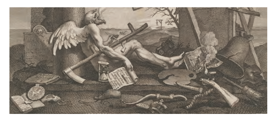
Fig. 9 William Hogarth, Tail Piece, or The Bathos, March 3, 1764, detail

Hogarth was certainly injured by the censure of his work. Reflecting on 'the chief things that have brought much obliquy on me', he cited both The Analysis of Beauty and The Times , and complained of being '[p]estered with caricature drawings, and hung up in effigy in prints; accused of vanity, ignorance and envy'. He added that, 'to say that such malicious attacks did not discompose me, would be untrue'.<sup>51</sup>