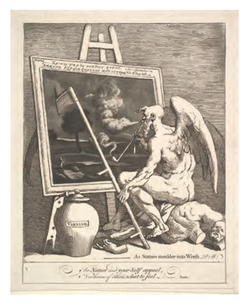
Fig. 7 William Hogarth, Time Smoking a Picture, c. 1761