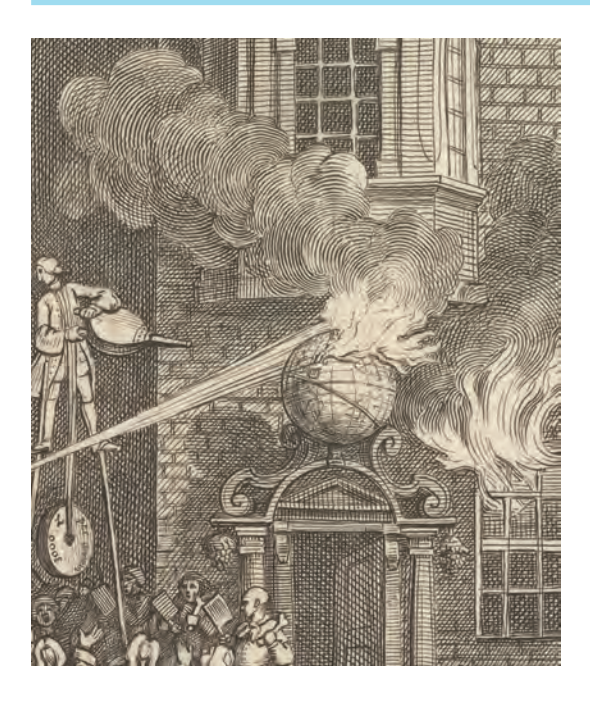
Fig. 5 William Hogarth, The Times Plate 1 , 1762, detail