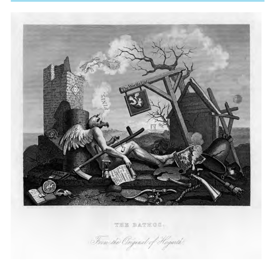
Fig. 1 William Hogarth, The Bathos , 1764 (19<sup>th</sup>-century reproduction 'From the Original of Hogarth')

The version of The Bathos that we used for publicity for the Dialogues of the Dead conference was taken from a nineteenth-century print 'from the original of Hogarth' in my own collection, The Wildgoose Memorial Library (Fig. 1). It is simply entitled The Bathos , but prints made from Hogarth's original plate in the eighteenth century included the words ' TAIL PIECE ' at the top, with 'THE BATHOS' and the subtitle 'or, Manner of Sinking, in Sublime Paintings, inscribed to the Dealers in Dark Pictures' in cursive script beneath the image (Fig. 2).