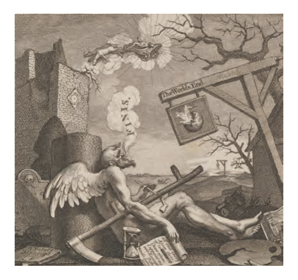
Fig. 8 William Hogarth, Tail Piece , or The Bathos , March 3, 1764, detail

In both The Bathos and Time Smoking a Picture , Time is depicted as a winged and naked bearded old man, with a distinctive forelock, holding a scythe. In The Bathos , the blade of Time's scythe (Fig. 8) appears to be broken off at the same point at which it is buried in the landscape painting in Time Smoking a Picture (Fig. 7)—where it is 'driven through [...] to give proof of its antiquity, —not only by sober , sombre tints, but by an injured canvas'.<sup>37</sup> The exhalation with which Time had darkened the colours in the painting to a fashionably antique hue in Time Smoking appears as his final breath in The Bathos . Spiralling upwards, the puff of smoke carries the word FINIS into the darkening sky to meet the cloud on which Apollo's chariot, with its driver and horses apparently all dead, is 'sink[ing] into endless night'.<sup>38</sup>