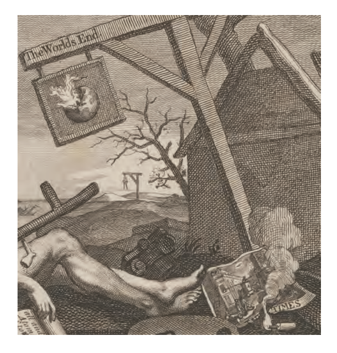
Fig. 3 William Hogarth, Tail Piece , or The Bathos , March 3, 1764, detail Metropolitan Museum of Art (Public Domain)