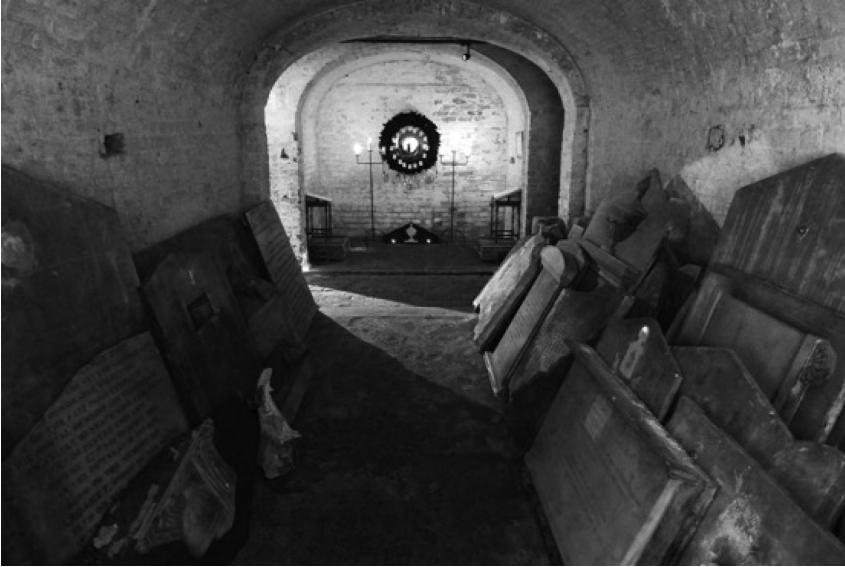
Fig. 7 Lost But Not Forgotten wreath, in Passing Fables & Comparative Readings at The Wildgoose Memorial Library: Collecting & Interpreting Human Skulls & Hair in Late 19 th Century London , Crypt Gallery St Pancras, 2014 © Jane Wildgoose, The Wildgoose Memorial Library.

the ‘active presence’ exerted by a burial site—especially when it is ‘full of names, biographical details, icons and epitaphs’, which ‘have the effect of endorsing the notion that they truly do function as libraries in stone’ 22 (Fig. 7).