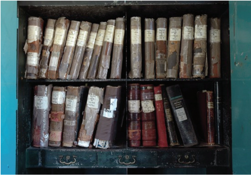
Fig. 2 Burial Registers, West Norwood Cemetery, 2013.

and effect a separation from the dead but also and above all to humanize the ground on which they build their worlds and found their histories'. 9