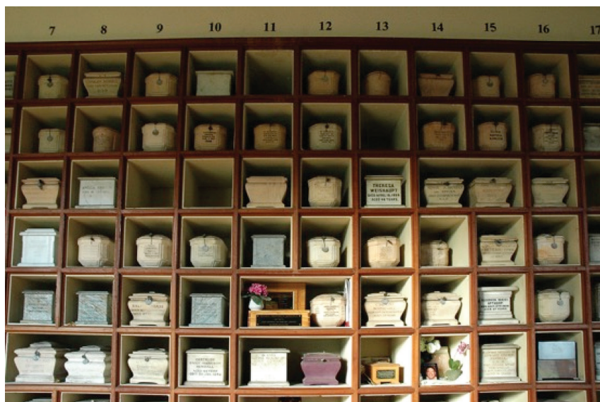
Fig. 3 Columbarium, West Norwood Cemetery, 2013.

Cemetery (preserved by one of its managers), in the Maddick Mausoleum. At the centre of the installation, I presented a broken and re-embellished antique ‘immortelle’ wreath of glass-beaded flowers from my collection, of the type traditionally left on graves in France. 11 I was present in the installation as Keeper of The Wildgoose Memorial Library on a number of days during the exhibition, and this provided the opportunity to speak with visitors. I asked them whether they thought it mattered where human remains were deposited? I also asked them did they care? If they did—and no one I spoke to said that they did not care, while many evidently cared very much—then I invited them to write the name of someone significant to them who had died, together with the place of interment or where their ashes were scattered, on printed cards (based on a Victorian mourning card in my collection) which were added to the wreath (Fig. 4).