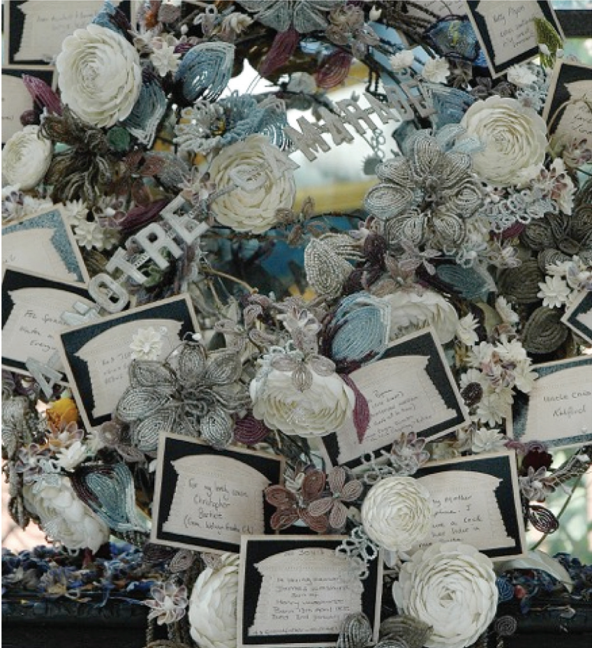
Fig. 5 Immortelle: À Notre Camarade , detail, 2013.

West Norwood Cemetery © Jane Wildgoose, The Wildgoose Memorial Library.