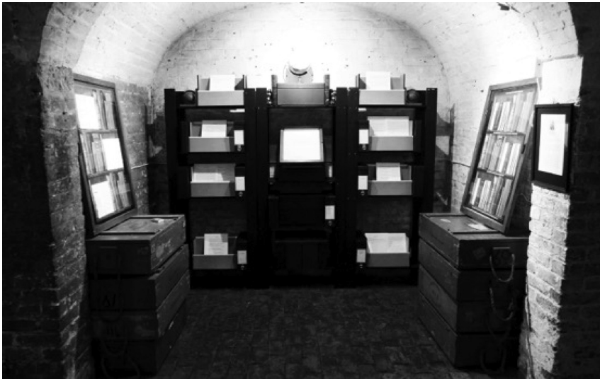
Fig. 6 Lost But Not Forgotten archive in Passing Fables & Comparative Readings at The Wildgoose Memorial Library: Collecting & Interpreting Human Skulls & Hair in Late 19 th Century London , Crypt Gallery St Pancras, 2014 © Jane Wildgoose, The Wildgoose Memorial Library.

The site-specific settings—which, at St Pancras, retain numerous objects related to the commemoration of the dead, including plaques identifying family vaults, and a series of nineteenth-century gravestones with names and dates of birth and death engraved on them—were selected as situations in which to reflect upon afterlife writing, and the ethical dimension of addressing claims from Indigenous peoples for the repatriation of their ancestors' remains from museums. In these settings, the questions raised about contested human remains resonated within