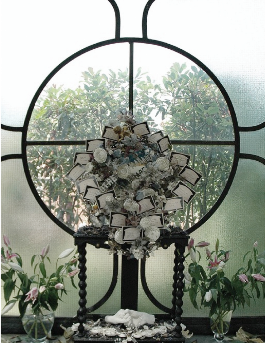
Fig. 4 Immortelle: À Notre Camarade , in A Question of Archival Authority , 2013. West Norwood Cemetery. © Jane Wildgoose, The Wildgoose Memorial Library.