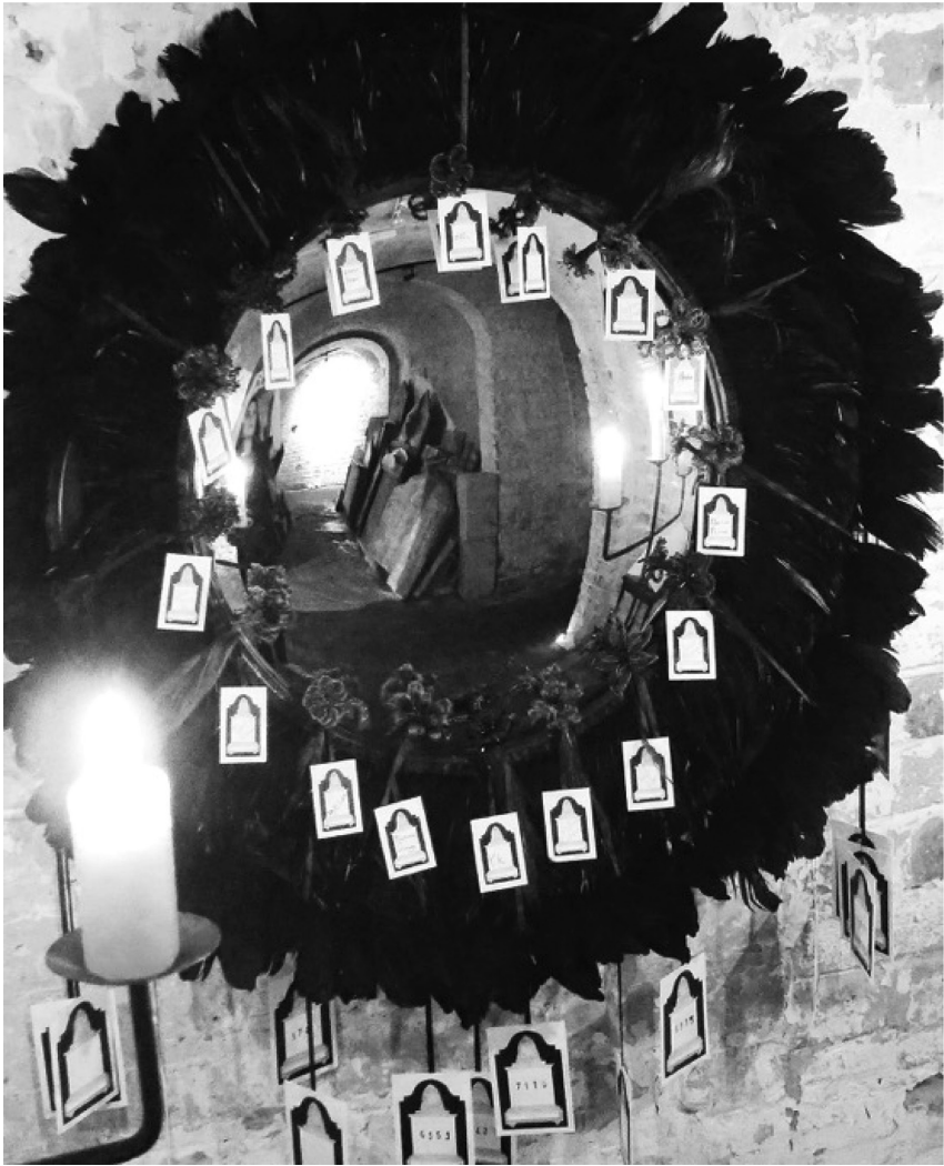
Fig. 8 Lost But Not Forgotten wreath, in Passing Fables & Comparative Readings at The Wildgoose Memorial Library: Collecting & Interpreting Human Skulls & Hair in Late 19 th Century London , Crypt Gallery St Pancras, 2014 © Jane Wildgoose, The Wildgoose Memorial Library.

most important discussion’, adding, ‘[w]ere I not entering these dream-like chambers—could I find the psychic space to encompass the moral dilemma?’ 25