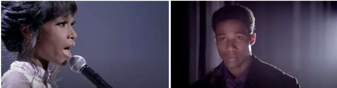
Figures 9 and 10

on stage in front of a large audience at an unidentified concert hall (figure 9), singing her signature song from the soundtrack of The Bodyguard . Like Louis in Lady Sings the Blues , Bobby stands in the wings of the stage; Whitney’s performance is intercut by thirteen close-ups of Bobby watching his wife sing (figure 10).