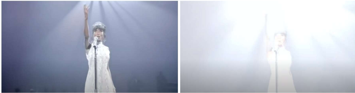
Figures 13 and 14

light, signifying — quite obviously — her death (figure 14). Here the triumph/tragedy divide is reconciled. Not only is her relationship with Bobby brought to a close (he clearly loves her, yet, as Whitney sings, 'we both know I'm not what you need'), but the tragedy in her private life is also left behind, including the tragedy that was still to come, undoubtedly known to the off-screen audience, yet left untold.